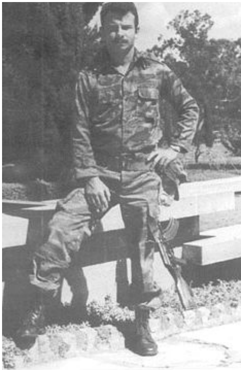
Integrity and Solidarity

efforts to throw off the yoke of oppression that was crushing our humanity with slavery, lynching and Jim Crow. How many of us would have gladly given our bodies and souls and volunteered to fight shoulder to shoulder with the Angolans against the Apartheid hordes?