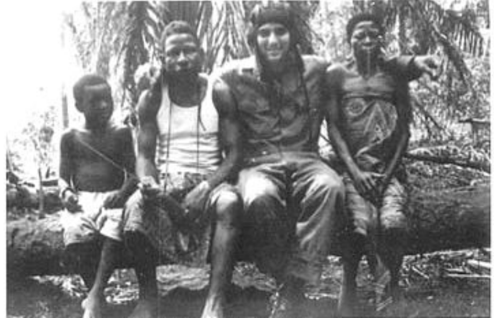
The risks we take show our priorities