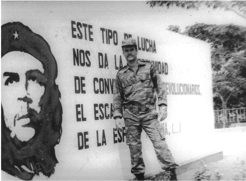
With respect, duty, truth and Love