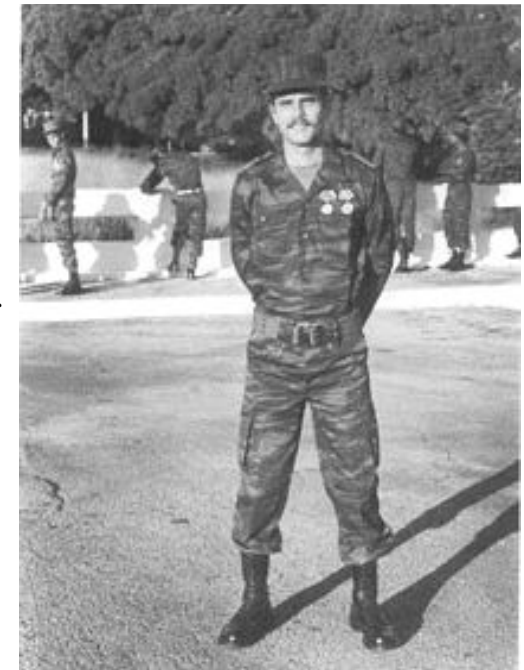
Honor and Protect