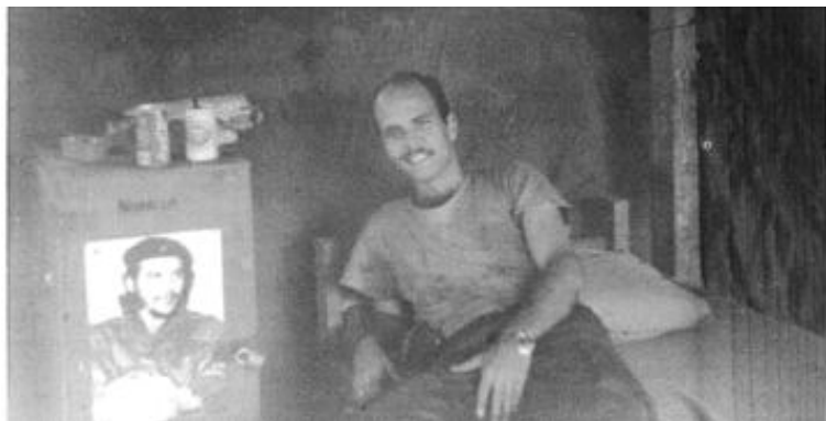
Bravery and Truth

empower the torturer of our sisters and brothers in Africa.